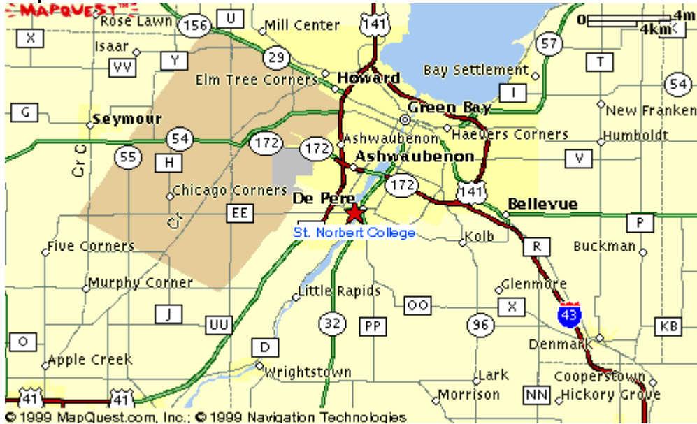
Map locating St. Norbert College in DePere